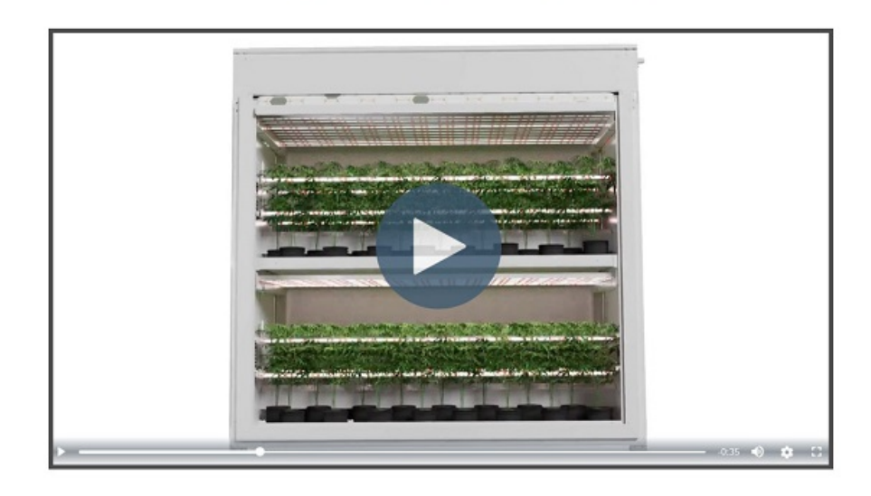
Click the Video or Here to Watch Online